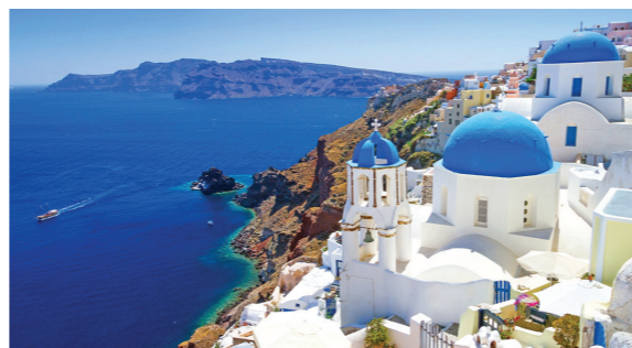
In Santorini : Cleaning and marking caldera's monuments and paths; Small scale restoration activities at Scaros castle; Mapping of cultural and natural sites of Santorini's caldera.