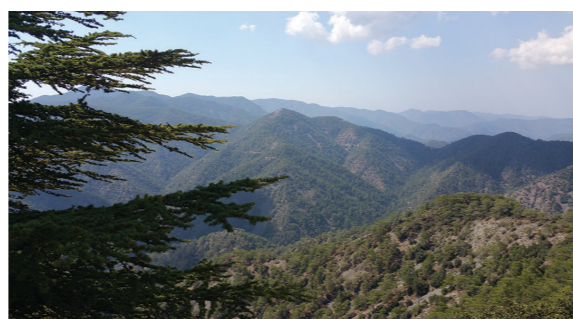
In Paphos-Forest : Reconstruction of an old 14km long trail; Exhibition; Documentary film; Educational programs; Restoration of historical mill.

■ The Hellenic Centre for Marine Research team will undertake mapping and enhancement of marine biodiversity and habitat types surrounding Nessebar, Butrint and Santorini.