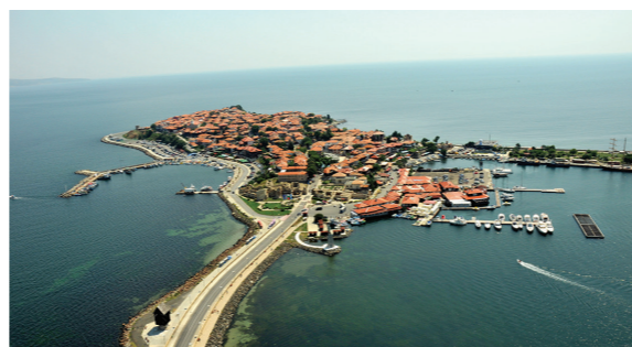
In the Old Town of Nessebar : Reconstruction of the road network.