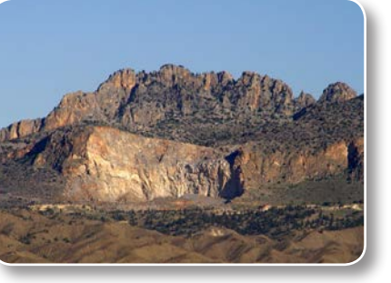
The Pentadaktylos mountain cres