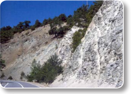
and harzburgite (mantle, distant view)

Upon the reopening of the Gibraltar Strait and the reconnection of the Mediterranean Sea with the Atlantic Ocean, a new cycle of sedimentation began (5 - 2 Ma). The Nicosia Formation was deposited first and contains grey and yellow siltstones and layers of calcarenites and marls. Upwards it consists of calcarenites interlayered with sandy marls (Athalassa Member). They follow the Apalos and Fanglomerate Formations, which consist of clastic river deposits (gravels, sand and silt).