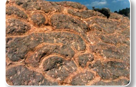
ellipsoidal pillow shape