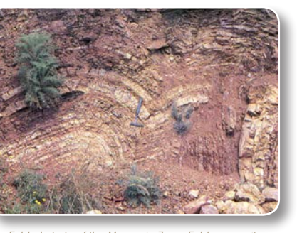
Folded strata of the Mamonia Zone, Folds are quite common in the Zone due to the high degree of deformation

The groundwater resources of Cyprus depend mainly on rainfall and the ability of the aquifers to store and transmit water. The main aquifers develop in areas of clastic deposition and chiefly in broad valleys and river deltas. Such aquifers are those of western and eastern Mesaoria, Akrotiri and Pafos. Aquifers also develop in porous rocks such as calcarenites, in limestones and gypsum and in fractured rocks of the Troodos ophiolite, especially in the gabbros.