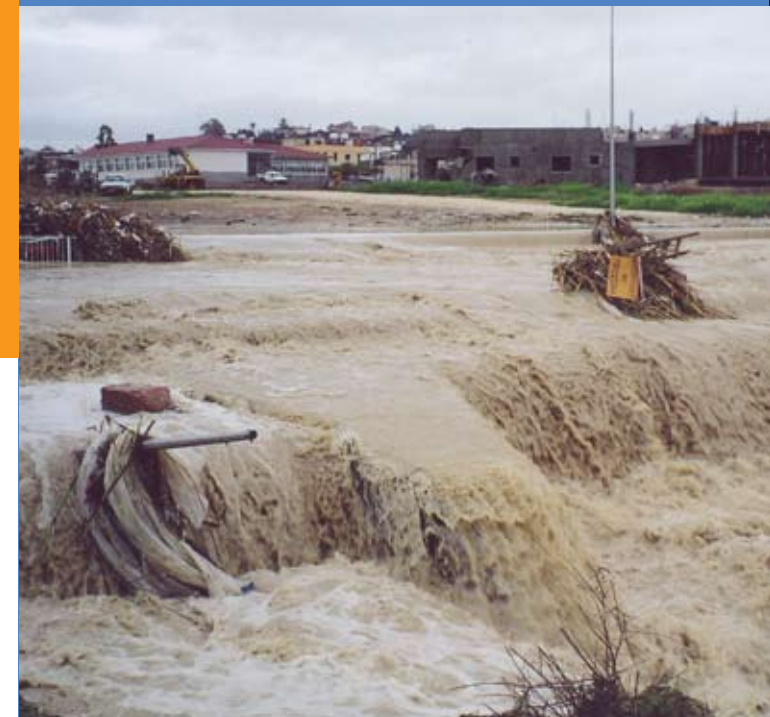
Catastrophic results of flood (Pedieos River, Lakatamia, Lefkosia)

WDD TAY WATER DEVELOPMENT DEPARTMENT www.moa.gov.cy/wdd