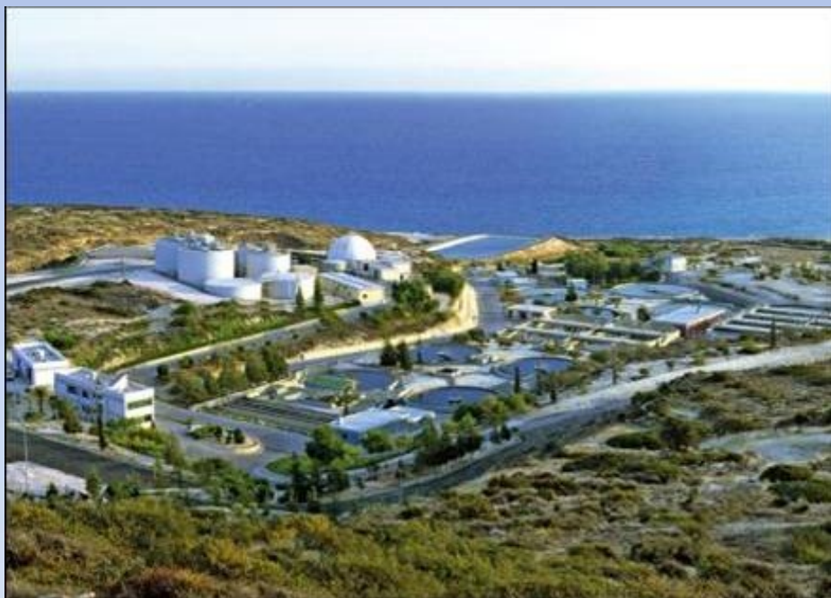
LIMASSOL (MONI) WWTP

REPUBLIC OF CYPRUS MINISTRY OF AGRICULTURE , RURAL DEVELOPMENT AND ENVIRONMENT